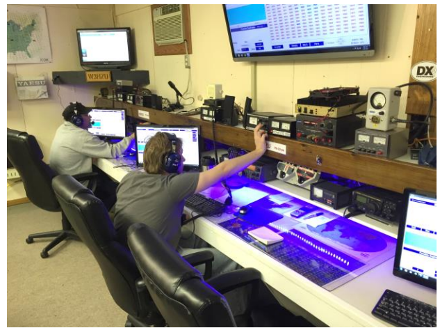
Operations on 6 meters started at 2 PM ... Continued on Page 2

Saturday, January 24th, was the date of the ARRL VHF Sweepstakes. In this contest, the object is to make as many contacts on VHF and above as possible. This year we were to operate on 6 meters, 2 meters, and 70 CM. On the day before, we had a "Wintery Mix" of ice, snow, and freezing rain and found both the 2 meter & 70 CM contest antennas displayed an SWR of over a 4 to 1! The 6 meter antenna, at a much lower height was okay.